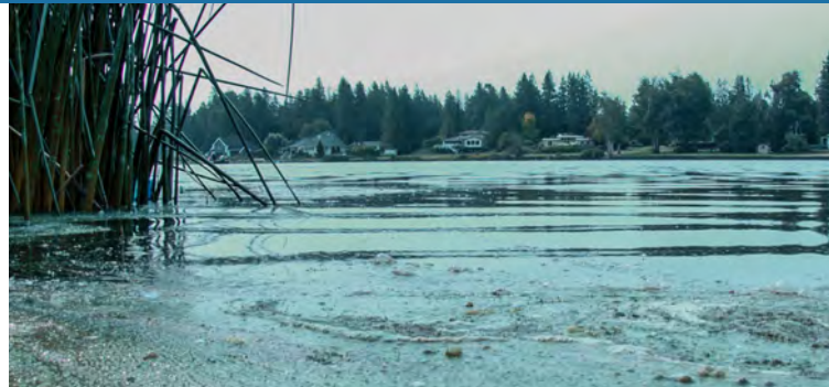
Wiser Lake: Our year-long data collection effort will help understand & mitigate harmful algae blooms.

Cost-benefit estimates show that effective school-based programs can save $18 for every $1 spent.