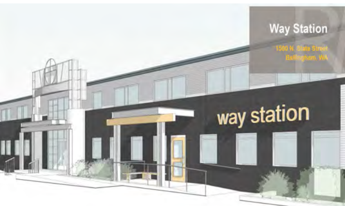
Concept illustration of the State Street Way Station Facility.

Along with our partners, we look forward to opening the doors of the Way Station this fall. The Way Station, located at 1500 State Street in Bellingham, will offer respite beds for individuals exiting the hospital, hygiene services, medical and behavioral health care and connections, as well as case management and referral services. These services will be provided by PeaceHealth, Opportunity Council, and Unity Care NW. The second floor will co-locate Whatcom County EMS and WCHCS teams including syringe services, GRACE and LEAD.